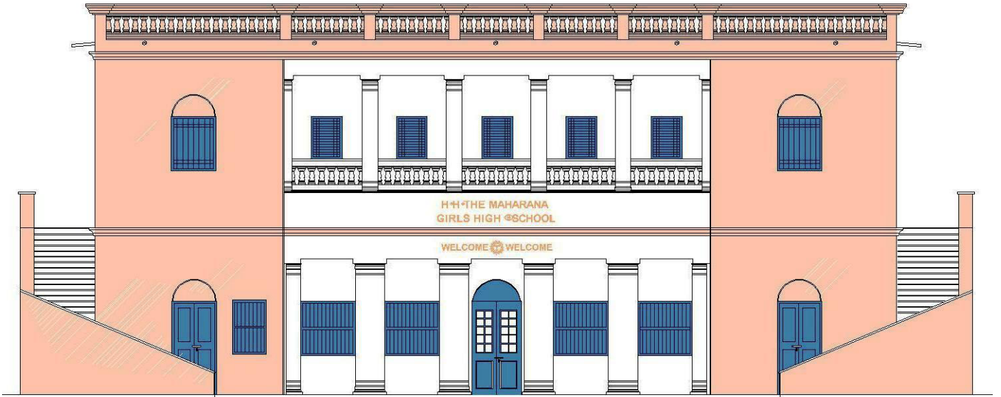
RESTORATION AT A GLANCE

MMCF RESTORED THE EASTERN AND WESTERN FAÇADE OF THE SCHOOL BUILDING. THE COST OF THE PROJECT WAS RS. 32 LAKHS FOR PHASE I.