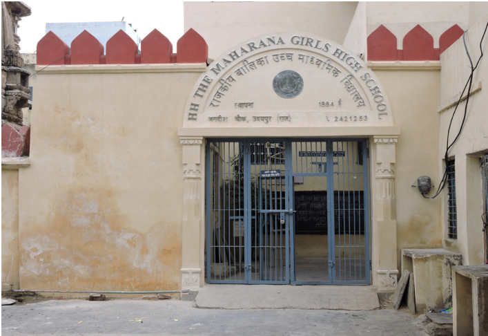
AFTER (MAIN ENTRANCE)