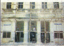
Work started at the outer façade of the school building.

The salient features of the restoration of the school to be carried out include the use of experienced conservation professionals, well qualified and experienced site supervisors, traditional master craftsmen, skilled workers with proper plans.