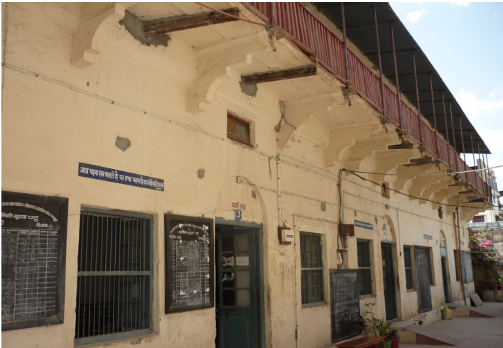
BEFORE (EASTERN FACADE)