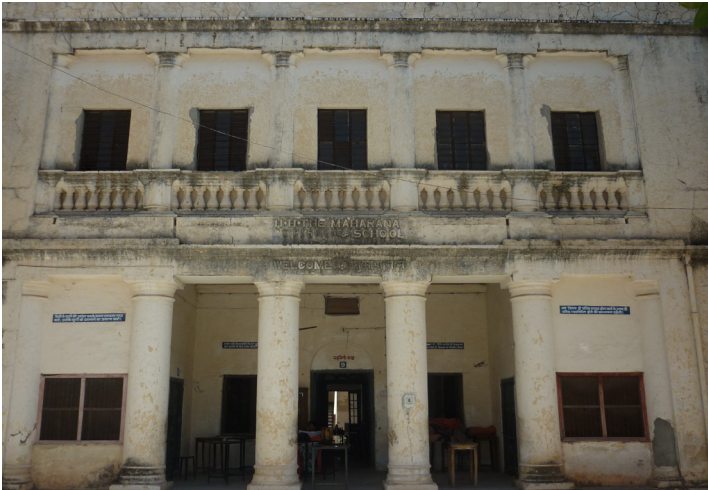
BEFORE (WESTERN FACADE)