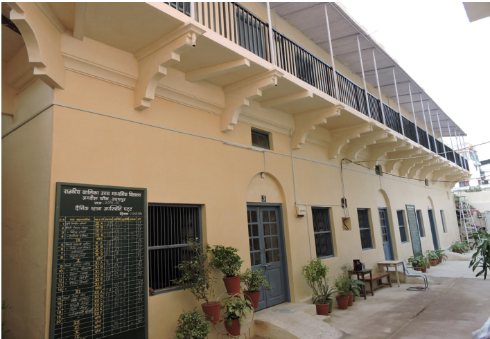
AFTER (EASTERN FACADE)