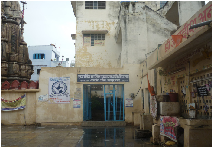
BEFORE (MAIN ENTRANCE)