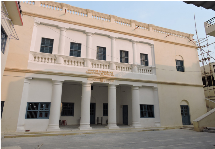
BEFORE (WESTERN FACADE)