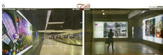
The Delhi Metro Rail Corporation and the India Habitat Centre join hands to make art accessible to the public

http://www.eternalmewar.in/fm/newsarchive.aspx?Id=1917&catId=95