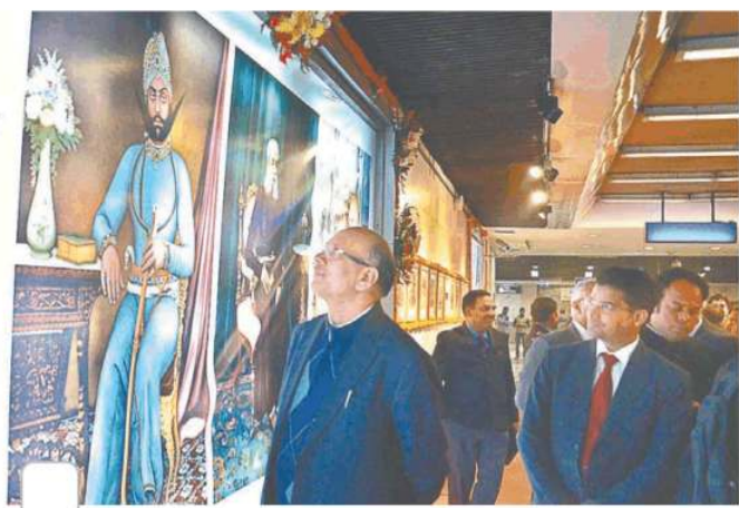
जोरबाग और मंडी हाउस मेट्रो स्टेशनों पर ऐसे पैनल लगाए गए हैं।