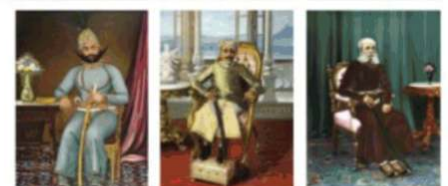
(Clockwise from top) Bankey Bihari temple; Maharana Fateh Singh; Maharana Bhupal Singh; Maharana Sajjan Singh