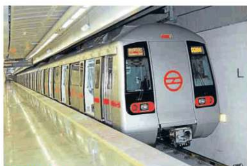
ART IN PUBLIC SPACE An array of artworks and photographs will be put on display at selected Metro stations, as an initiative by India Habitat Centre and DMRC.